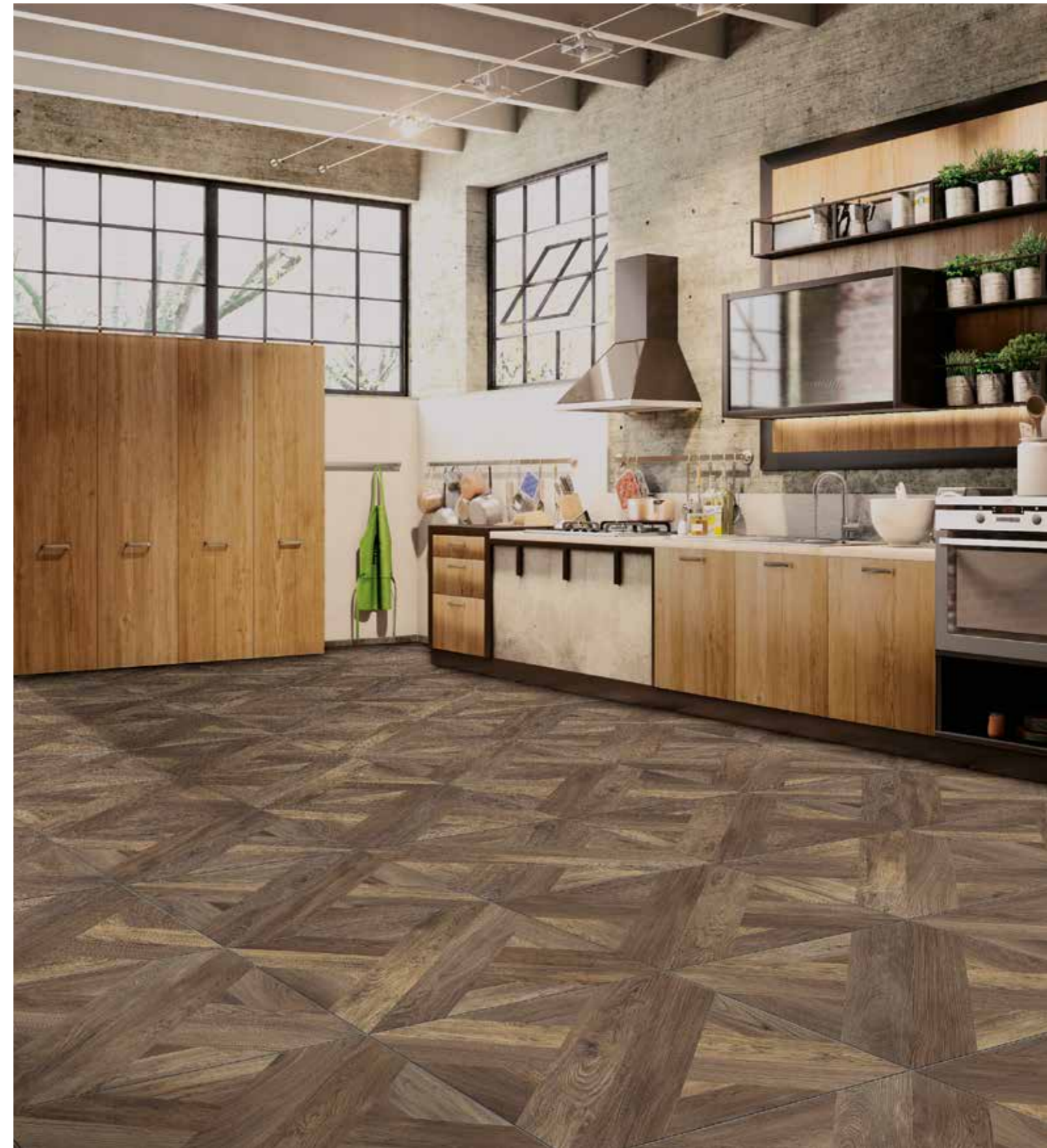
Moro 61,0x61,0 cm RS/24"x24" RS