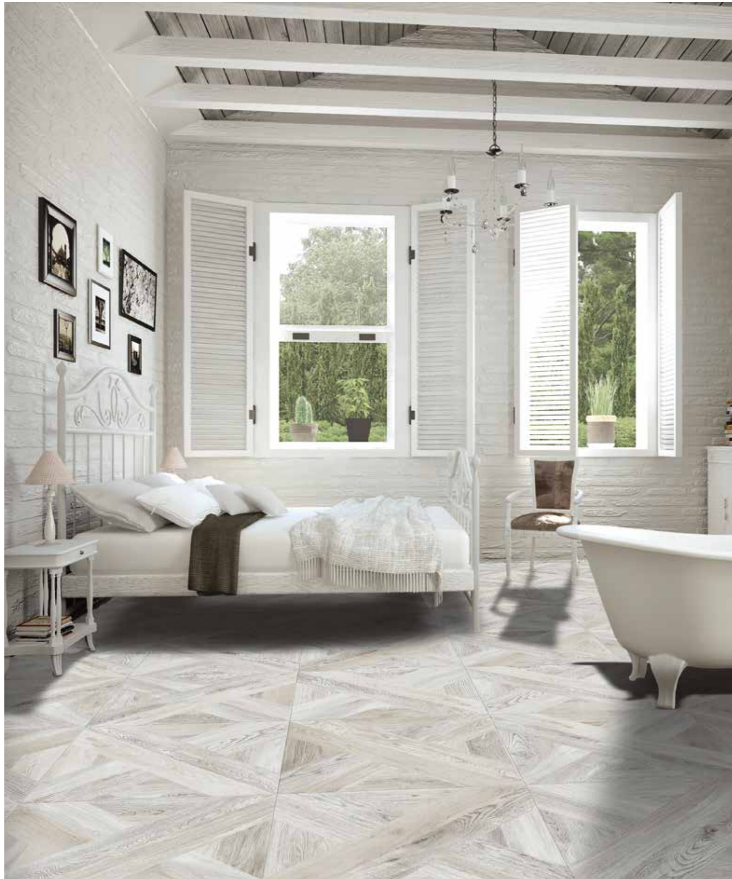
Bianco 61,0x61,0 cm RS/24"x24" RS